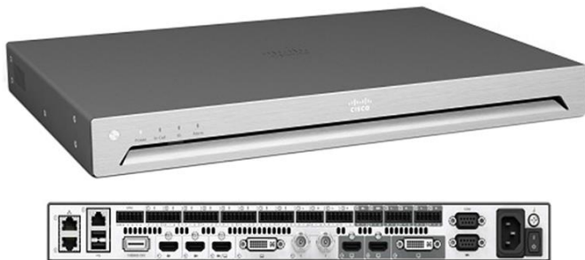
Figure 1. Cisco TelePresence SX80 Codec

Cisco offers three SX80 Integrator Packages to reduce the need for external equipment and the overall cost of enabling video in larger meeting rooms: