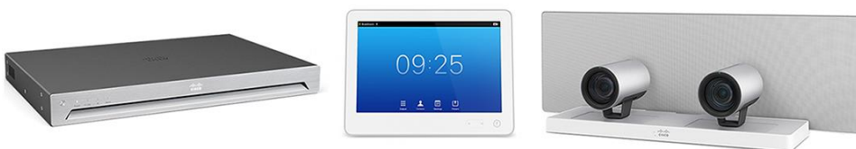
Figure 2. Cisco TelePresence SX80 Integrator Package with Touch 10 and SpeakerTrack 60

With its powerful media engine, the SX80 Codec lets you build the video collaboration room of your dreams.